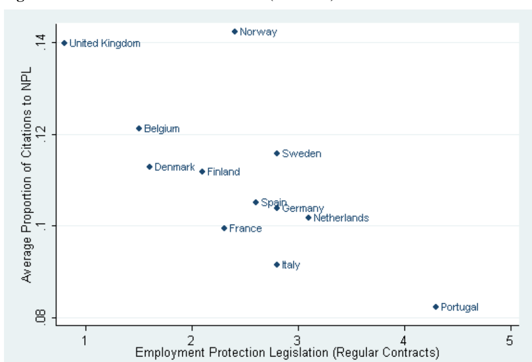
Figure 1: EPL and Radical Innovation (all firms)

Notes: The graphs shows the relationship between radical innovation and EPL for the 37,350 private sector firms registered in the countries presented that filed patents in the period 1997 to 2003. These firms were responsible gor the filing of 230,322 patents in this period. The x-axis shows the average index for Employment Protection Legislation (Regular Contracts from OECD (XXXX) over the period 1997-2003. The y-axis shows the average proportion of citations made to the scientific literature by subsidiaries located in each country over the period 1997-2003.