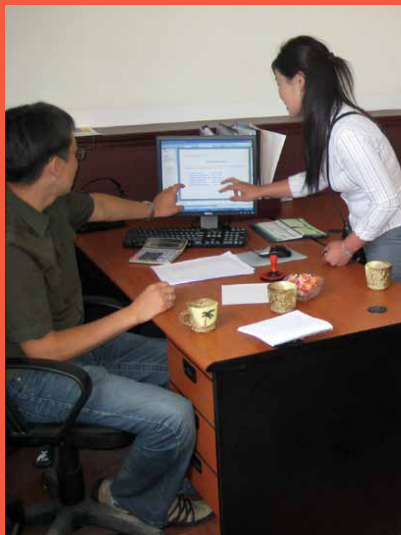
1: Inside a branch of XacBank 2: Loan officers, Bulgan Province